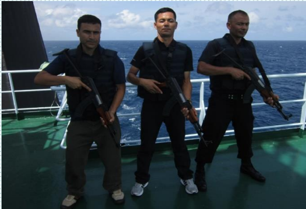
Our Gurkha MSO at high seas