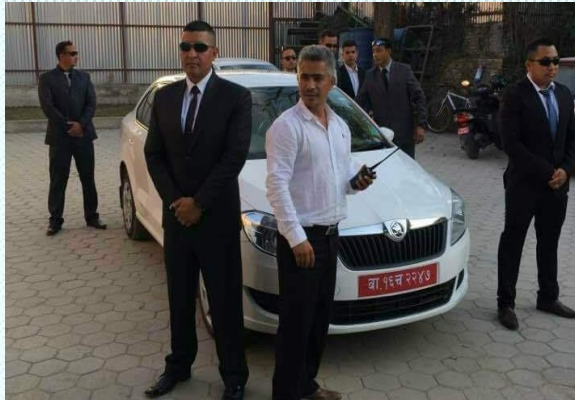
Gurkha VIP personal detail