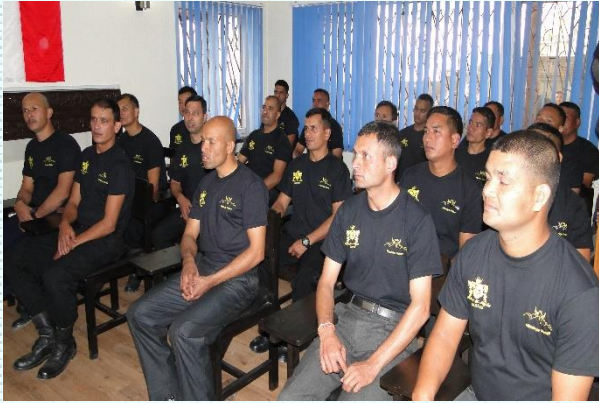
Gurkhas orientation class